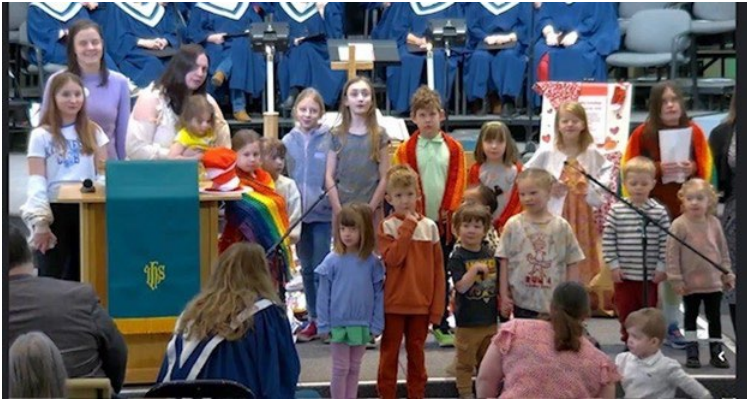
We finished with all kids singing “I wonder Where’s My Underwear Song.”